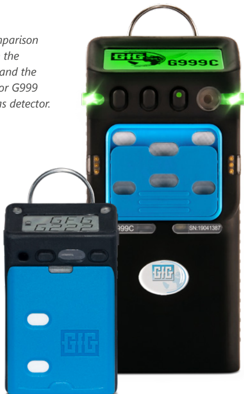
Size comparison between the Micro 5 and the Polytor G999 multi-gas detector.

« Certified for use in underground operations. »