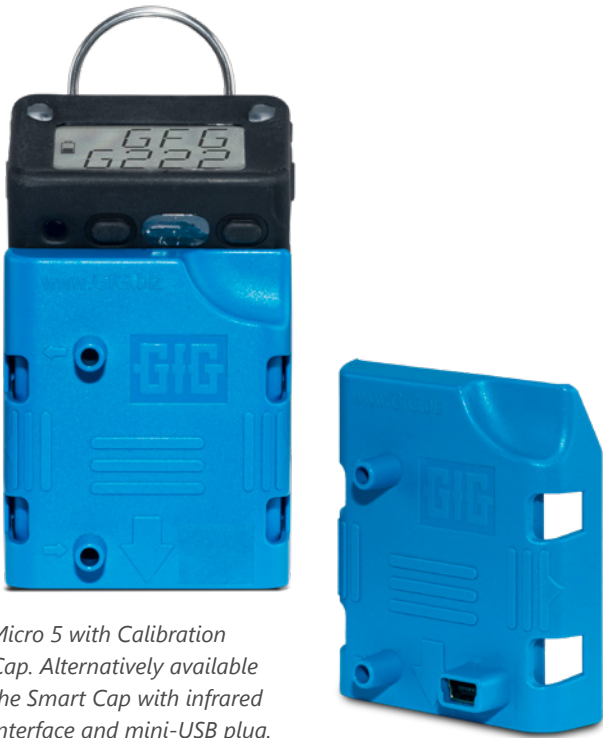
Micro 5 with Calibration Cap. Alternatively available the Smart Cap with infrared interface and mini-USB plug.

If you want to read out the content of the data logger, you will need the Smart Cap, a USB connection cable and the Config Software for the G222 series instead.