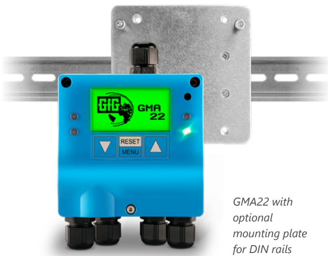
GMA22 with optional mounting plate for DIN rails

Even more flexibility results from the option to address not only the transmitters but also up to 4 additional relay modules of type GMA200-RT or GMA200-RTD via the digital RS485 interface.