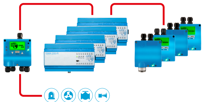
GMA22 maximum configuration

ACDC (Analog Carrier for Digital Communication) is a patented technology of GfG. It allows an analog transmitter to communicate with a controller via a 4-20 mA line in the same way that a digital transmitter communicates via a bus connection. This allows, for example, for remote calibration of an analog transmitter. However, the prerequisite is that both devices are ACDC-capable.