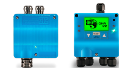
CC22 ex and GMA22-M controller