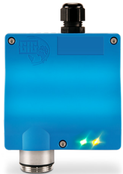
ZD22 D transmitter with one cable entry for analog connection

In combination with GfG's powerful controllers, both variants are the right choice for long-term oxygen monitoring.