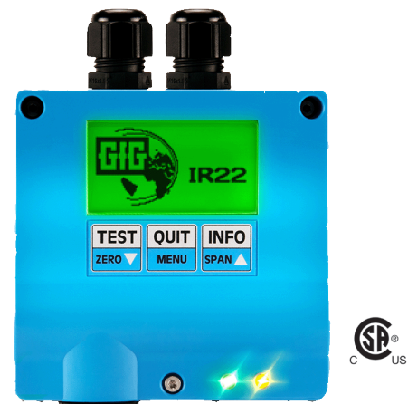
IR 22 CO 2 Gas Measurement Transmitter

Cannabis can be sold in the form of leaf or buds, but the most valuable products are essential oils and extracts. Extraction is the process of separating the active chemicals from the raw material, and turning it into a usable form. Medical extracts are mostly based on cannabidiol (CBD) while recreational extracts are based on tetrahydrocannabinol (THC). The most common extraction techniques involve the use of flammable gas or solvents to separate the chemicals from the plant material. Extraction rooms are hazardous locations where explosive concentrations of gas or vapor can easily develop.